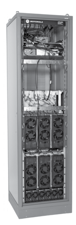
GTR 8000 Expandable Site Subsystem

Designed to carry your needs into the future, the G-series hardware platform has built-in functionality and flexibility with an AC/DC - 48VDC power supply and two-branch receive diversity capacity, as well as a linear power amplifier for improved coverage in P25 FDMA Simulcast systems.